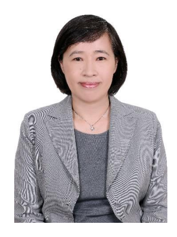
Shien-Quey KAO Deputy Minister of National Development Council